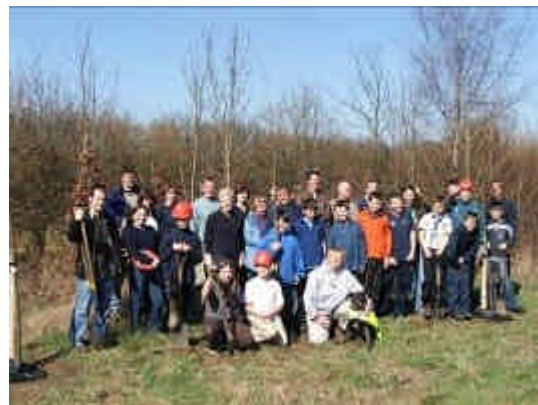
34 Volunteers + 34 trees = 1 job well done!

The play area provides a safe open space in the wood for children to run around. The circular planting scheme will provide a colourful backdrop for all seasons, as well as attracting wildlife with the fruit and blossom from the trees.