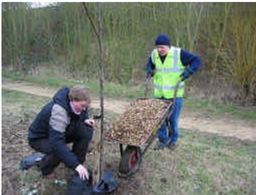
Hard at work planting the Cherry Tree Walk

This activity is part of a six-month campaign called Action Earth, supported by the Environment Agency. The campaign is organised by the national charity Community Service Volunteers (CSV) and involves over 750 voluntary organisations, businesses and community groups that will be undertaking projects that are of immediate and lasting benefit to the environment.